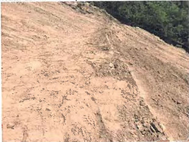
Fig. 3 Water bar with no depth to hold water