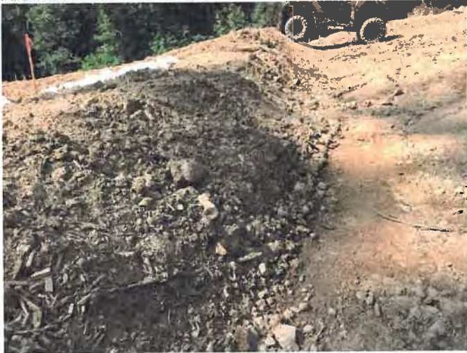
Fig. 1 Area above MVP-FR-291