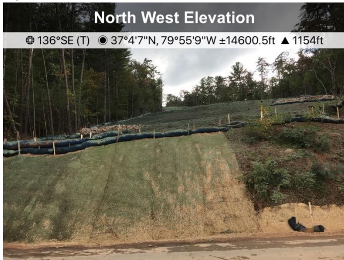
Fig. 1 At Cahas Rd intersection, matting has been installed with ECD's.