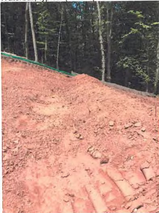
Fig. 3 Waterbar, typical (Area 1)