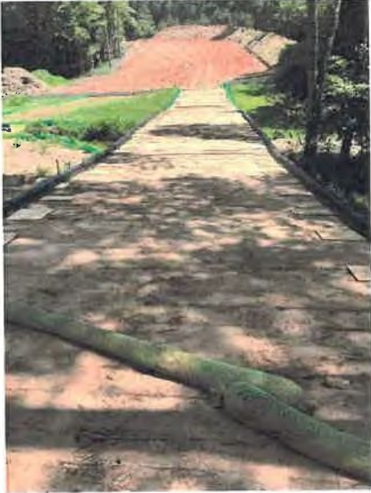
Fig. 1 Extended bumpers and install additional waterbar (Area 1)