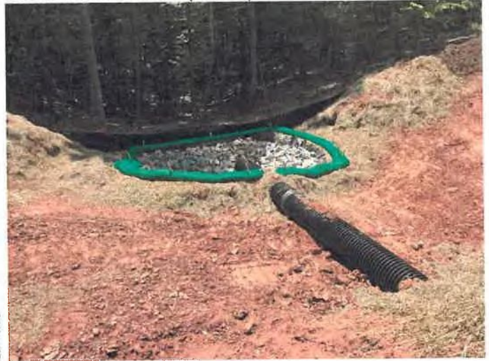
Fig. 2 Clean water diversion (Area 1)