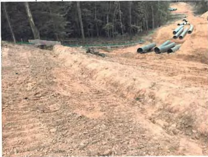
Fig. 1 Waterbar (Area 1)