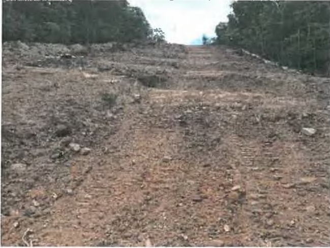
Fig. 5 Sinking Creek Mt, ahead of grade (Area 3)