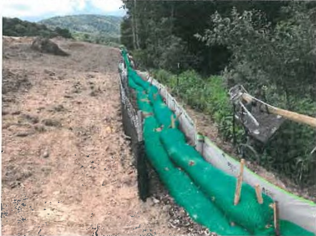
Fig. 7 Additional karst measures, ahead of grade (Area 3)