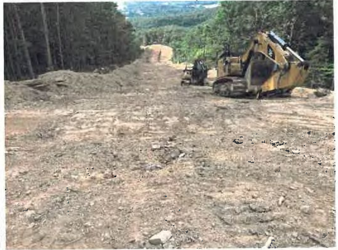
Fig. 2 Area of work on Brush Mountain (Area 1)