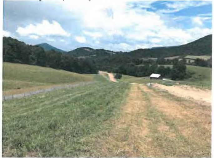
Fig. 6 Ahead of grade (Area 3)