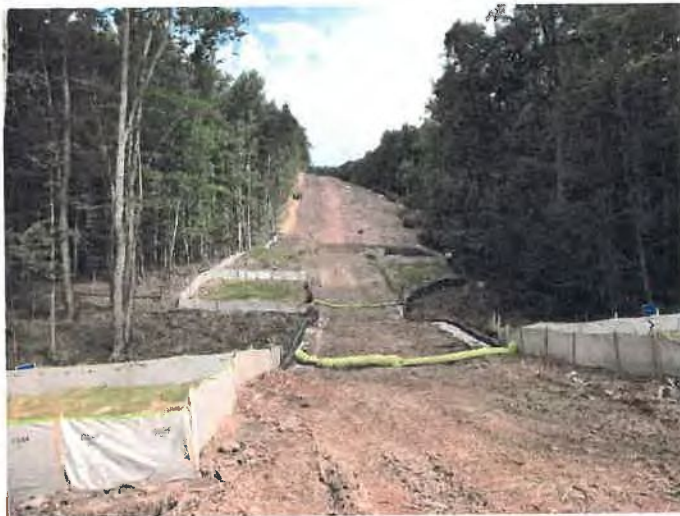
Fig. 3 Looking up Sinking Creek Mt, ahead of grade (Area 2)