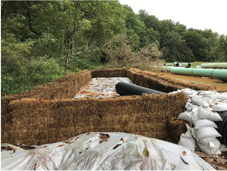
Fig. 1 MP 263 slope drain dewatering sump installed at St# 13887+00