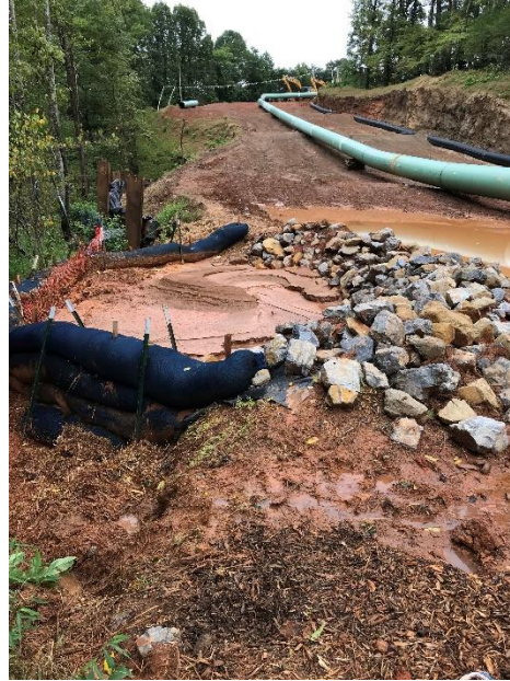
Fig. 2 MP 261 St# 13816+00 sump is full