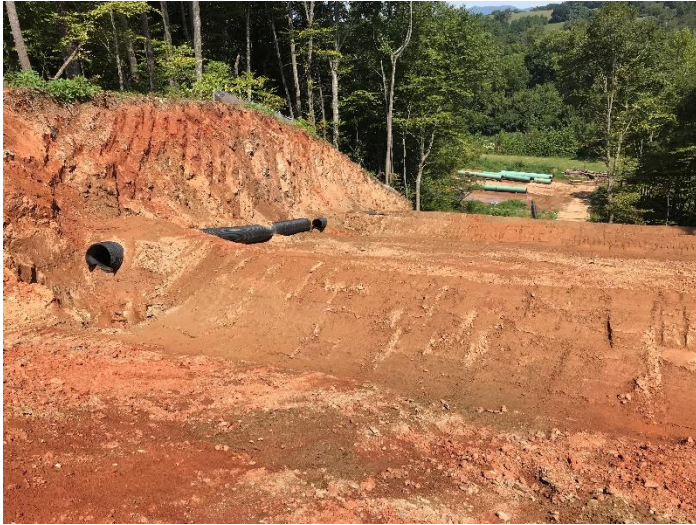
Fig. 1 Near station 13888+00 observed slope drain system not built per approval