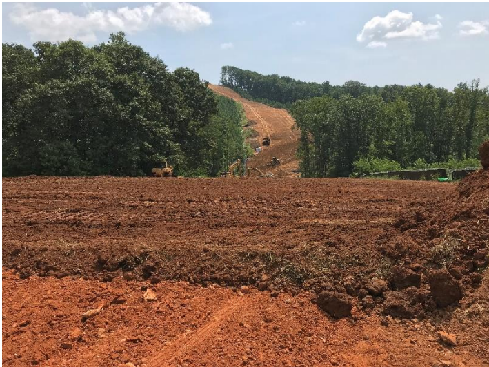
Fig. 3 Near station 13421+99, restoration in progress