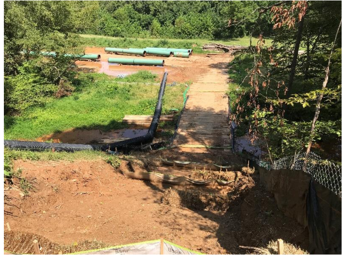
Fig. 2 Near station 13888+00 observed slope drain system not built per approval