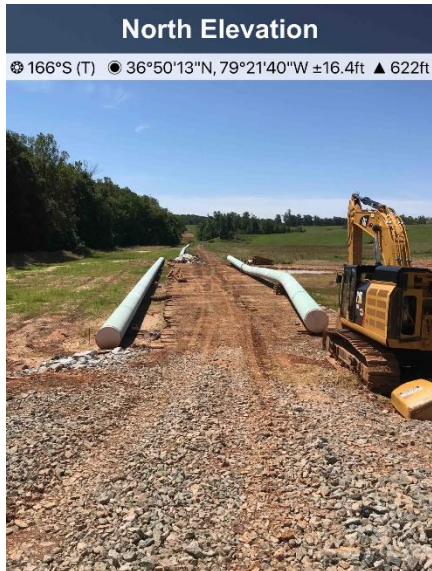
Fig. 3 Mat crossing material has been repaired at designated stream and wetland crossings W-H2, W-H3 and S-H5