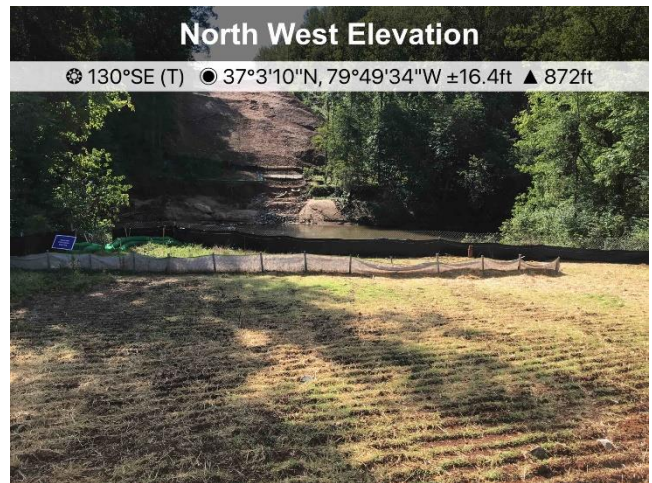
Fig. 2 At designated stream S-F11, bridge debris has been removed.