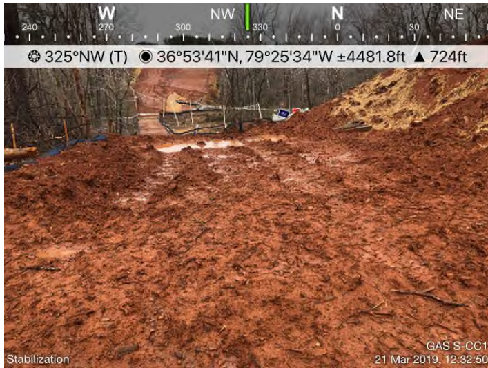
Fig. 1: STA 15596+87 to STA 15600+12 - Stabilize travel lane, no Earth Guard present.