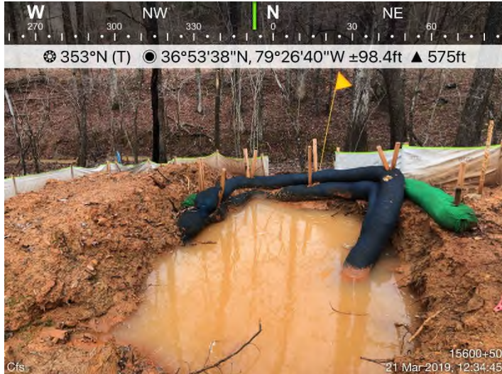
Fig. 3: STA 15600+50 - Repair end treatment.