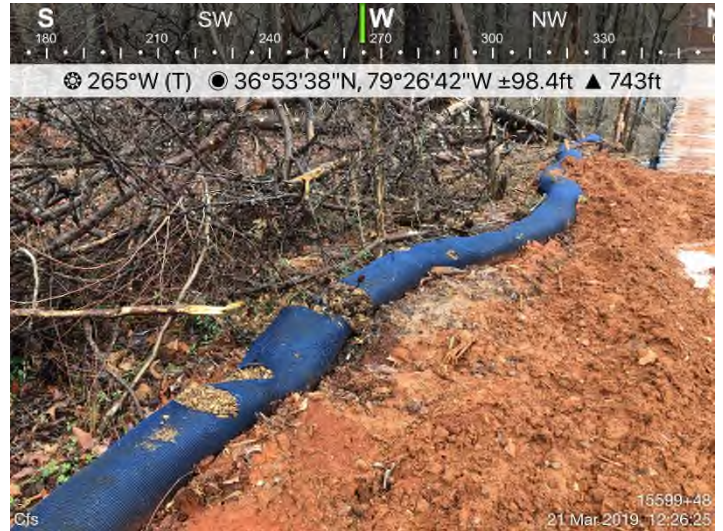
Fig. 2: STA 15599+48 - Repair CFS.