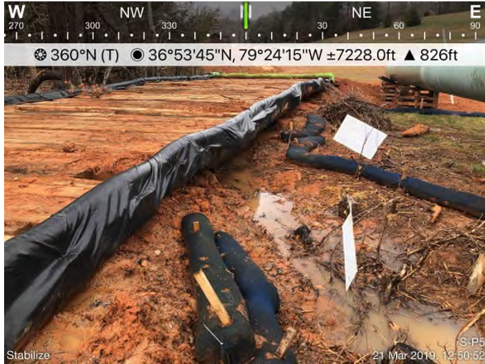
Fig. 9: STA 15614+94 - (S-P5) Repair CFS, remove sediment, stabilize banks.