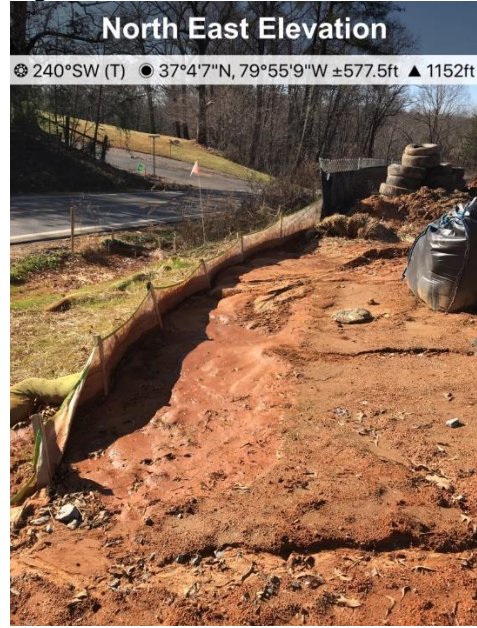
Fig. 2 St#13811 Silt fence is filled with sediment