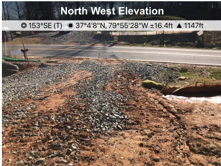
Fig. 3 Brick Church Rd construction entrance has signs of sediment in stone