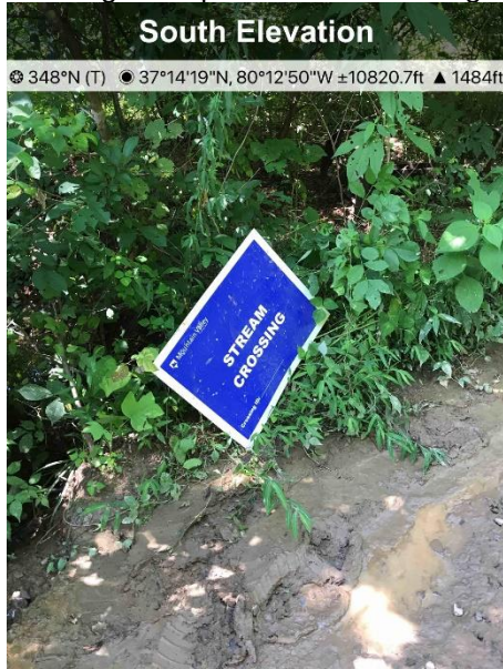
Fig. 1 AR MN-278.01 at designated stream S-EF54 crossing lacks protection at crossing.