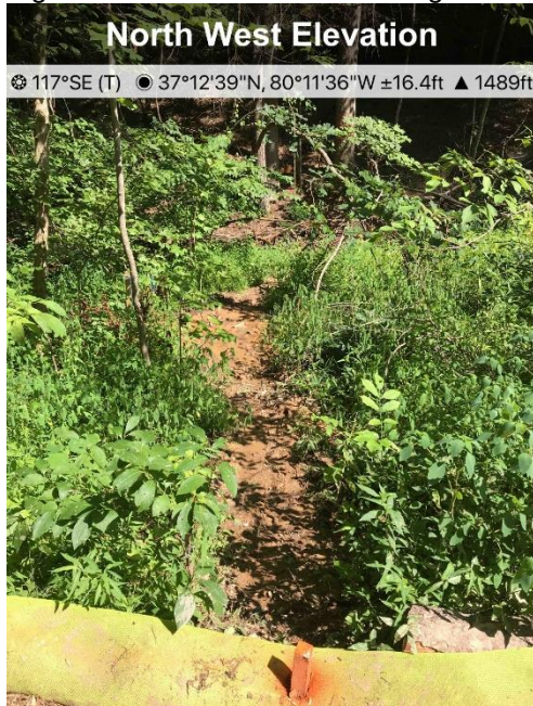
Fig. 3. Sediment off ROW in designated stream EF-20A