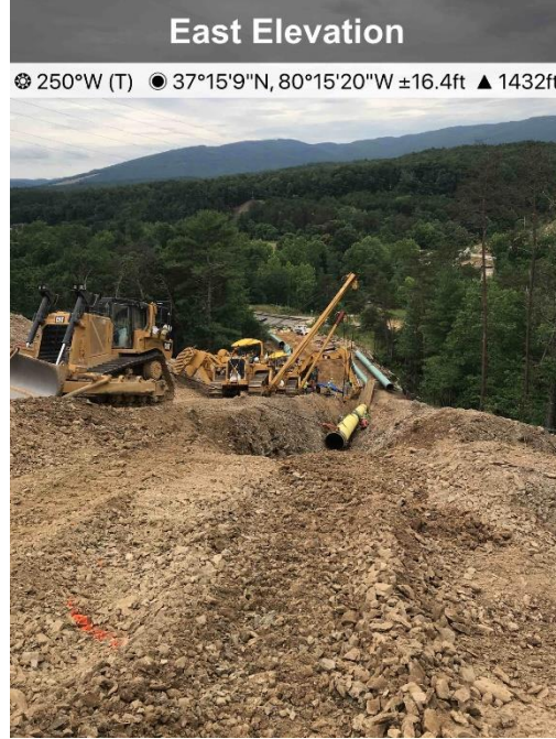
Fig. 2 ECD controls were in place during pipe install near St12209+00