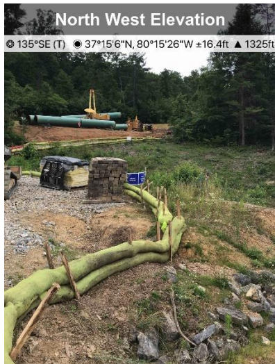
Fig. 3. ECD controls are in place at designated stream S-001