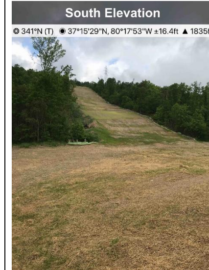
Fig. 2 St#12071+00 slope remains stabilized.