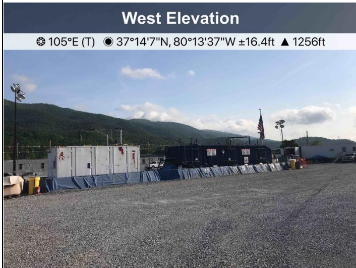
Fig. 1 Controls in place at PPY-006