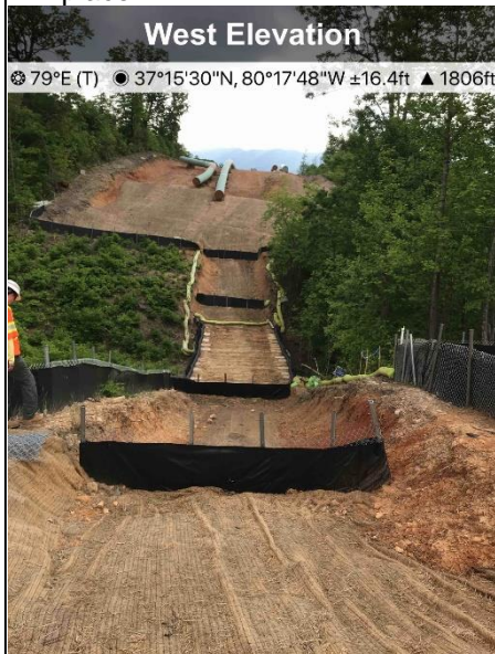
Fig. 3. Above designated stream MM-15 ECD's are in place.