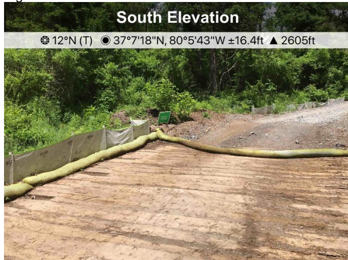
Fig. 3. Access Road 291 and W-EF3