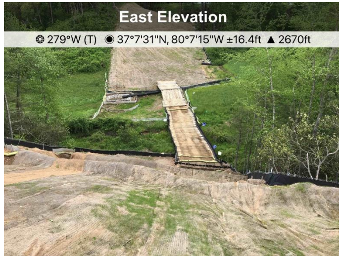
Fig. 1 Above designated stream G-24, ECD's in place