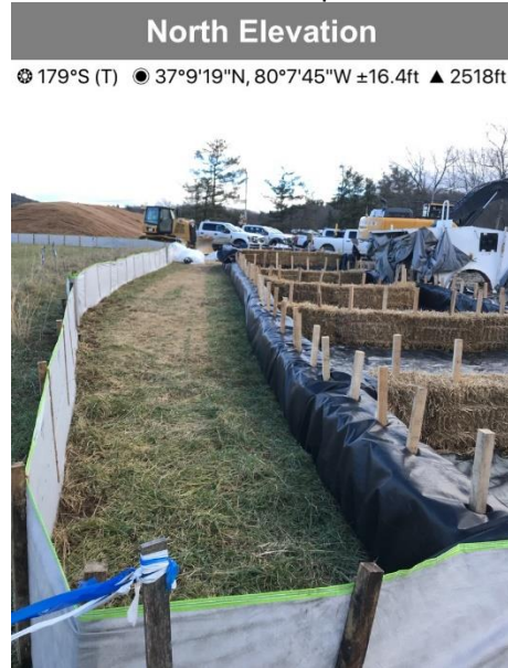
■ Fig. 2 Dewatering structure in place and functioning at the Bottoms Creek bore pit.