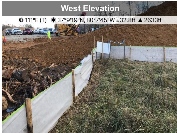
■ Fig. 1 Torn silt fence at St#12865+11