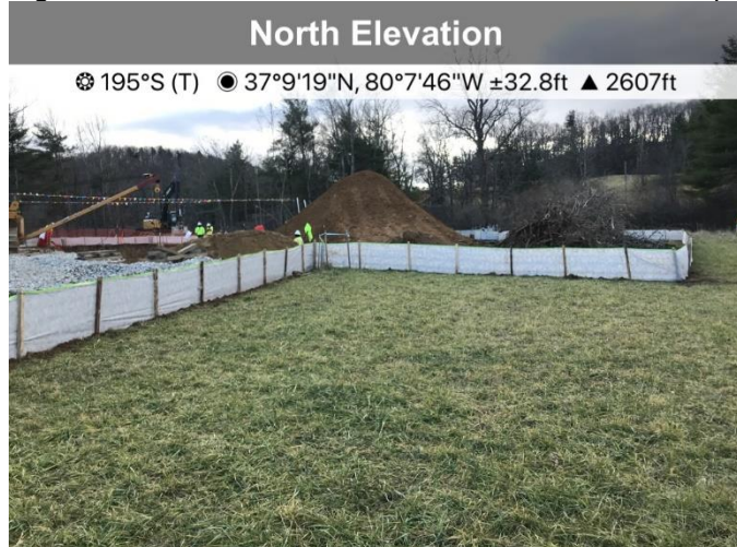
■ Fig. 3 Work within the LOD of the Bottoms Creek bore pit.