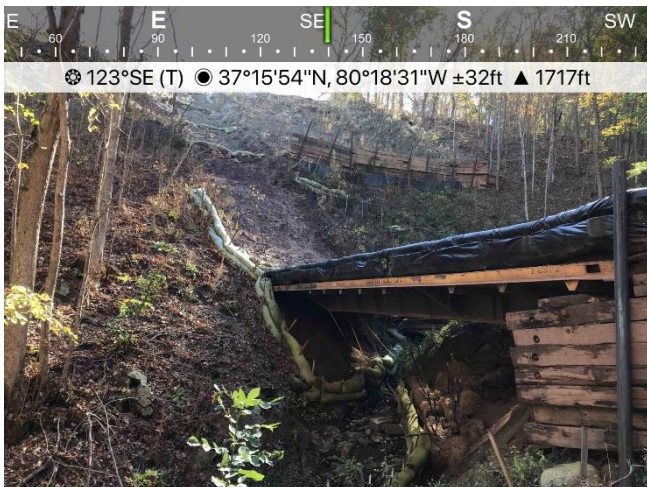
Fig. 3 ECD's are in place at designated stream S-G39