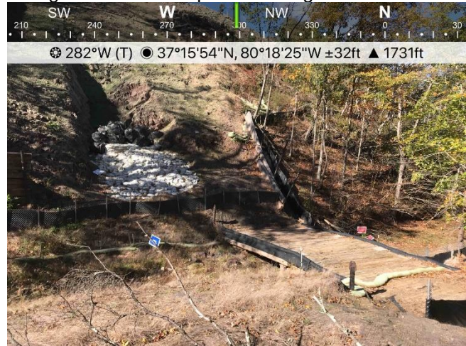
Fig. 2 ECD's are in place at designated stream S-G40