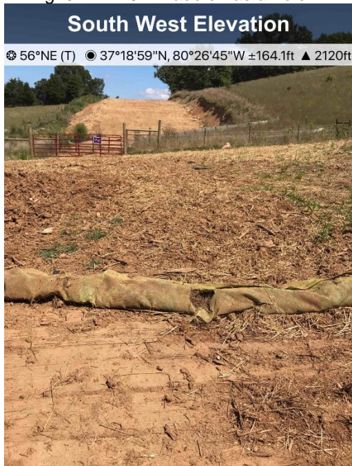
Fig. 3 MP216.4 waddle has a hole