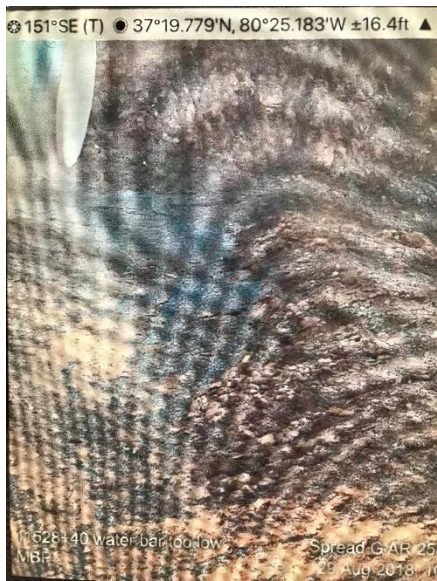
Fig. 3 Near MP 218 ST# 11529+40 water bar required maintenance