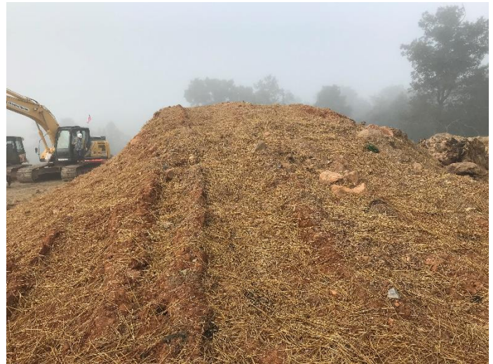
Fig. 2 Near Access Rd G-I234 stockpile had been stabilized.