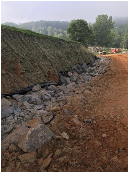
Fig. 1 Near Access Rd G-I234 rock lined channel was being installed.