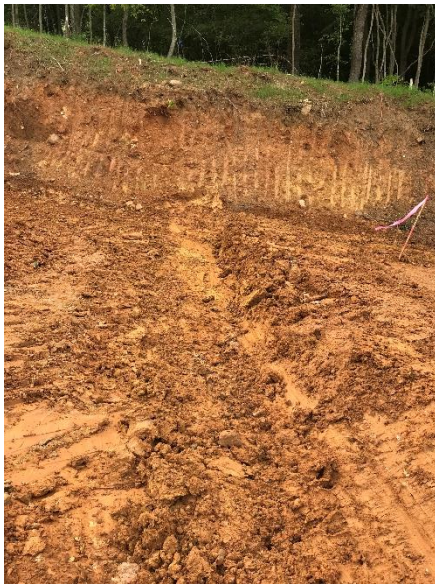
Fig. 3 Near station 11529+00 water bar observed required maintenance