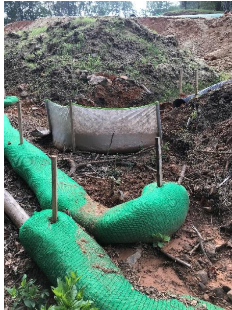
Fig. 2 Near station 11529+00 end treatment observed required maintenance