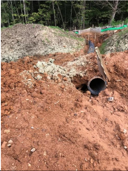
Fig. 1 Near MP258 station 11529+00, slope drain observed was not built to spec and water bar required maintenance