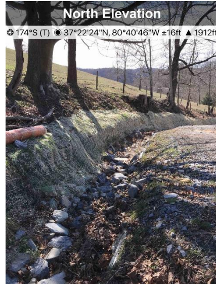
Figure 2: On access rd. GI-234, the ditch line remains blanket matted.