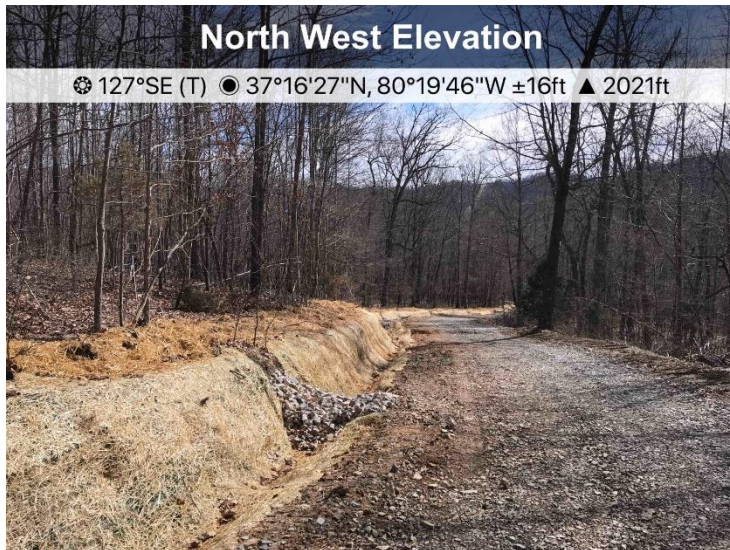
Figure 3: On AR MN-266, recent blanket matting and check dams have been installed in the ditch line.