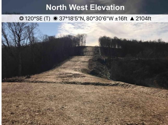
Figure 1: Near MP 293, ECD and stabilization is in place.