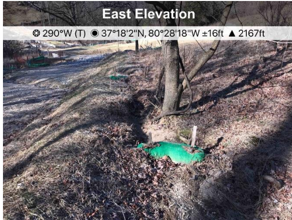
Fig. 1 Check dams at AR GI 256.02 require maintenance.