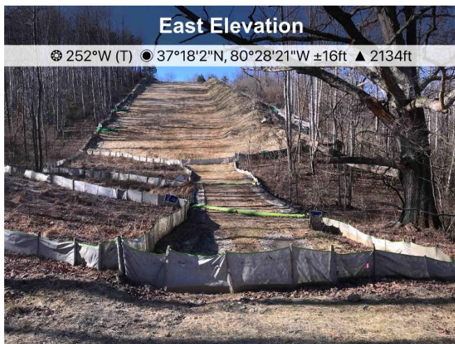
Fig. 3 At designated crossing S-NN12, ECD's are in place.