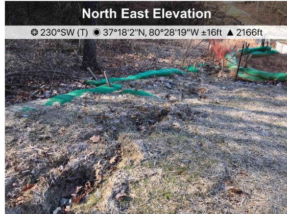
Fig. 2 On AR GI-256.02 erosion has occurred on road.