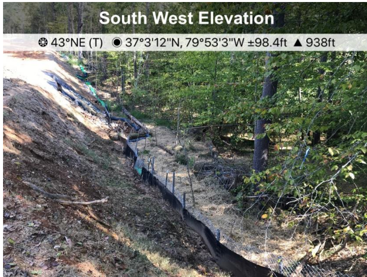
Fig. 1 At St#11399+00 MP265, sediment has been removed beyond ROW and slope has been repaired.