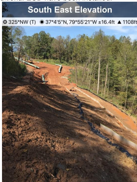
Fig. 3 At St#13819+00 MP261, slope has been repaired and additional ECD have been installed.