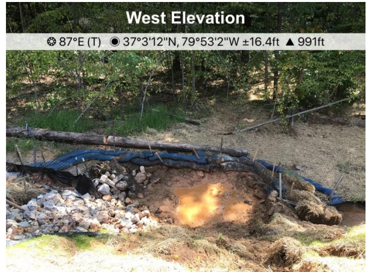
Fig. 2 At St#11399+00 sump