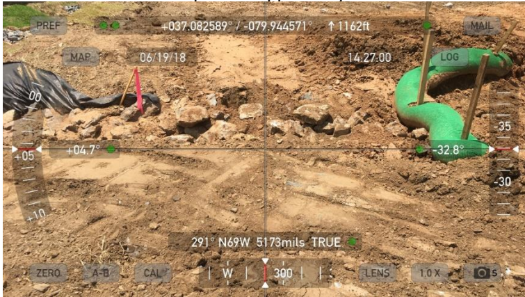
Fig. 3 Description: Water bar not installed per the approved plan