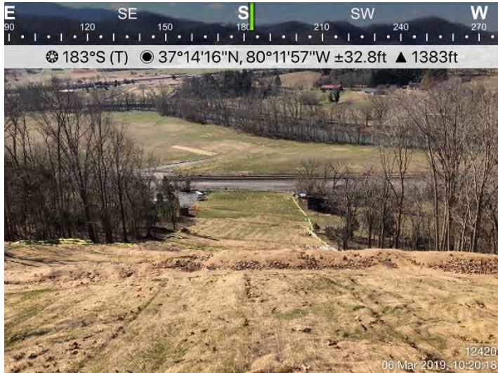
Fig. 1: STA 12420 – Area adequately stabilized. Controls in place.