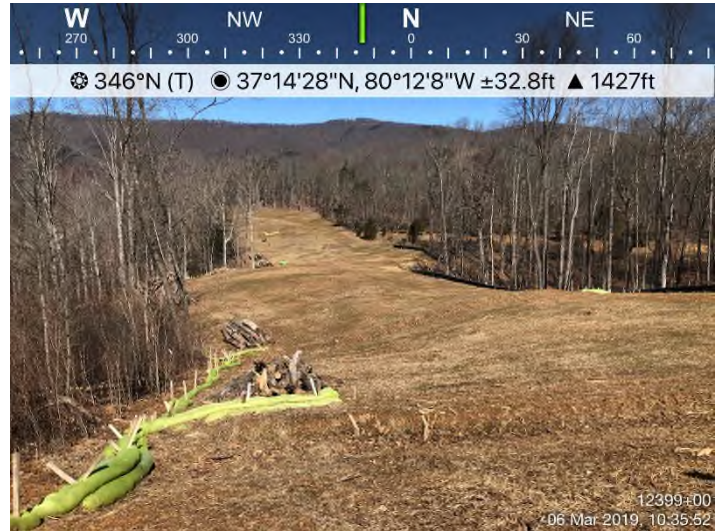
Fig. 2: STA 12399 – Area adequately stabilized. Controls in place.