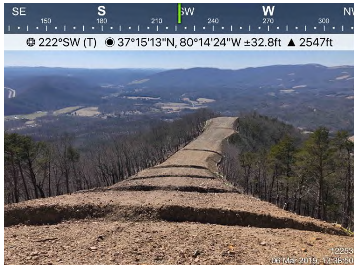
Fig. 6: STA 12253 – Area adequately stabilized. Controls in place.