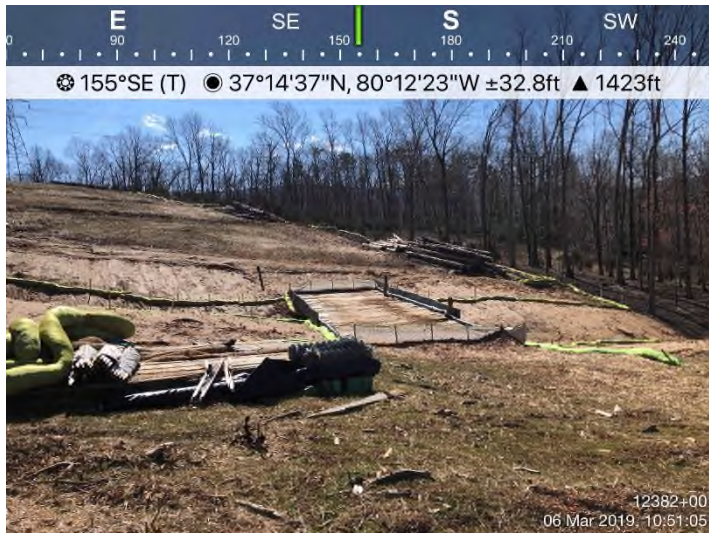
Fig. 3: STA 12382 – Area adequately stabilized. Controls in place.