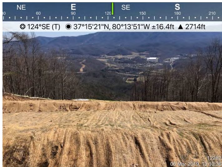
Fig. 5: STA 12282 – Area adequately stabilized. Controls in place.