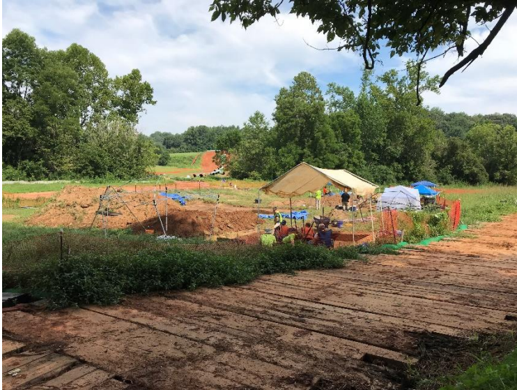
Excavation site well-protected with E&S controls and vegetated buffer.