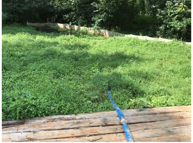
Trench dewatering hose leading to filter bag and silt fence.