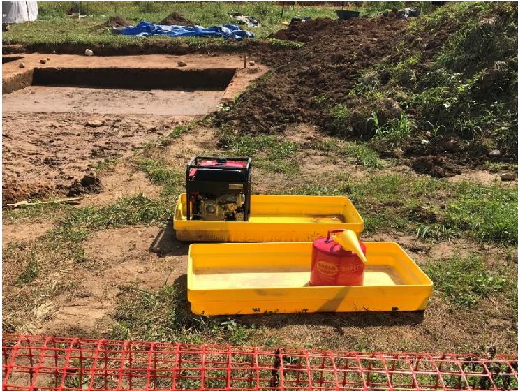
Pollution prevention measures for pump and fuel.