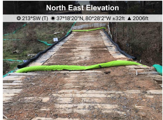
Fig. 2 Designated steam S-NN11, ECD's in place and functioning.