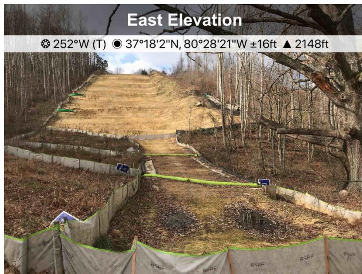
Fig. 3 Designated steam S-NN12, ECD's in place and functioning.