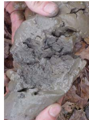
Figure 5: Completely gleyed, low-chroma soil matrix.

Munsell Color Charts book to determine the chroma of the soil matrix. The soil matrix is defined as the dominant soil constituent (>50%). Low chroma values (<2) or gleyed soils indicate continual saturation, while brightly colored soils or mottles (>2) indicate only short periods of wetting, typical of intermittent or ephemeral streambed soils or upland soils.