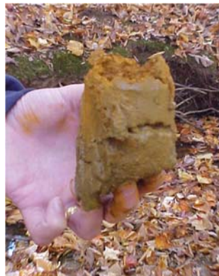
Figure 4: A high chroma soil matrix