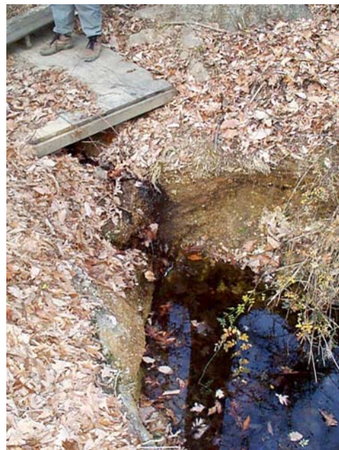
Figure 1: Example of a headcut where perennial stream flow begins.