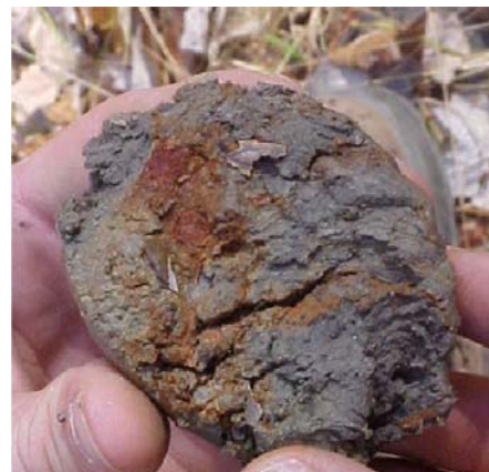
Figure 3: Iron oxidized mottling of a gleyed soil matrix.