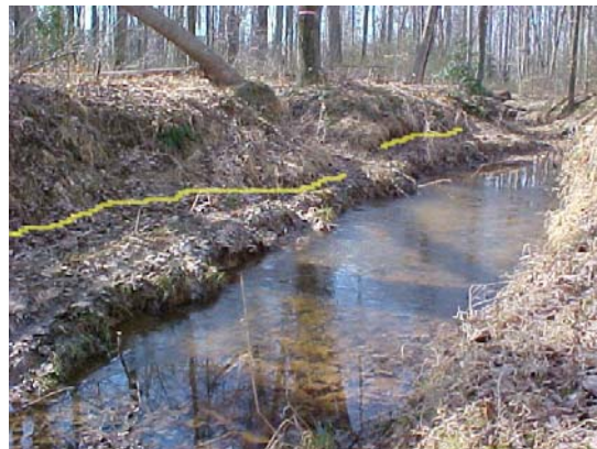
Figure 2: Examples of bank-full elevation (bench) in a second order, perennial stream.