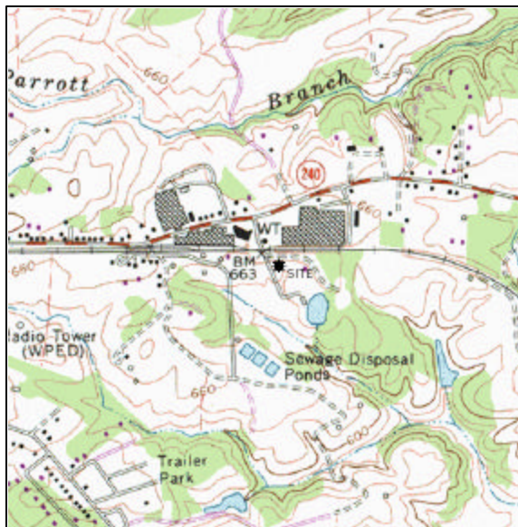
Topographic Site Map

Crozet, VA USGS Quadrangle (1973, Photorevised 1987), Scale = 1:2,000