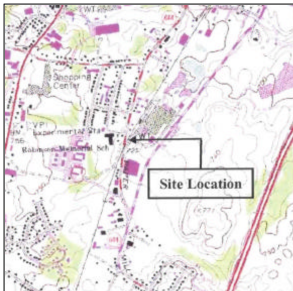
Topographic Site Map

Winchester, VA USGS Quadrangle (Photorevised 1987), Scale = 1 inch = 1,250 feet (approx.)